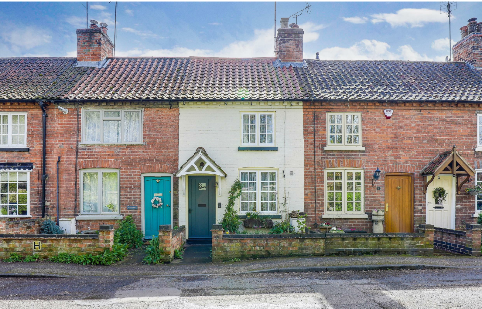
Dover Beck Cottage, Oxton, Nottinghamshire NG25 0SL